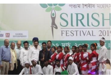
Runners up of dance competition

We thank our sponsor, partners, associates and well-wishers who have made the 5th edition of SIRISH Festival a grand success!