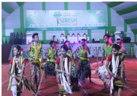
Winners of dance competition