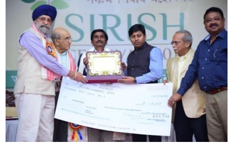
Cultural and Literature Icon Award