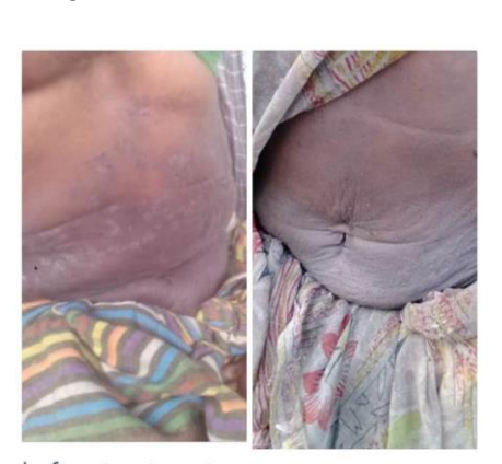
before treatment after treatment