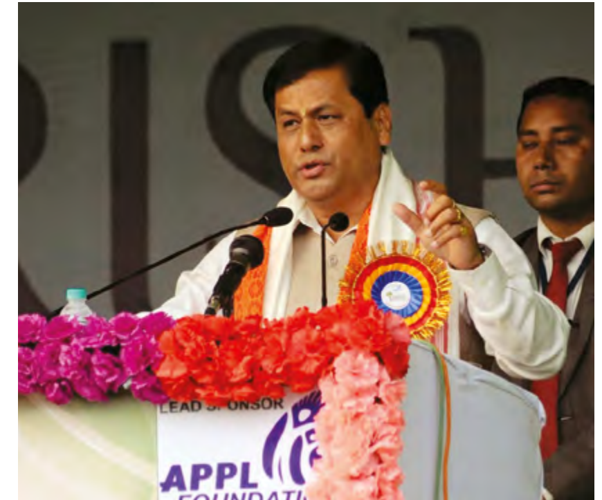
Hon'ble Chief Minister of Assam, Shri Sarbananda Sonowal addressing the audience at Sirish 2018

Assam Tea has carved a niche for itself globally: there can hardly be a tea lover who has not tasted pure Assam Tea. This great industry, however, exists because of those lakhs of Tea Garden Community who work tirelessly in the fields. These workers are descendants of the earliest workers who were indentured by the British to Assam from places like Bengal, Bihar, Odisha; even as far as Andhra Pradesh. This community comprises 15-20% of the State's population.