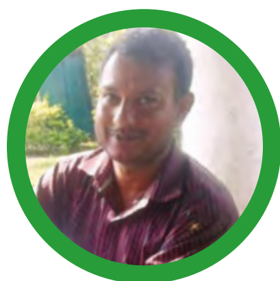
ABUL KALAM AZAD